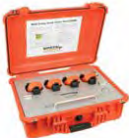
MGC Pump Clip Dock* Part# MGC-DOCK-PUMP High Pressure Part# MGC-DOCK-PUMP-HP