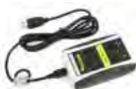
GCT IR Link Part# GCT-IR-LINK