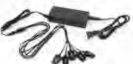
MGC Multi Charger Part# MGC-CHRG-MULTI

*Detector(s) or Telescoping Sampling Probe not included Please contact Gas Clip Technologies for additional spare parts, accessories & gas.