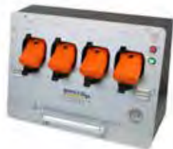
MGC Pump Clip Dock Wall Mount* Part# MGC-WMDOCK-PUMP High Pressure Part# MGC-WMDOCK-PUMP-HP