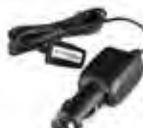
MGC Vehicle Charger Part# MGC-V-CHARGER1