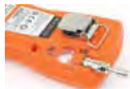
MGC Pump Quick Disconnect* Part# MGC-PUMP-QD